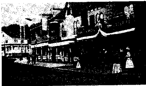
Ashford Avenue showing Murden's Saloon in the foreground at right, c. 1905.

In July 1878, the "Village of Ashford" made the Times again when a Sunday storm " spoken of as a tornado... a whirlwind " overturned small outbuildings and moved a " good sized barn from its foundation. " The havoc caused by that storm was kind by comparison to the havoc complained of the next time Ashford was mentioned, in May 1885. New York City's increasing need for clean water had led to the beginning of the construction of the new Croton Aqueduct and the digging of one its shafts (Shaft 14) smack in the middle of Ashford. More than a hundred workers gathered in and around Ardsley for several years, as did saloons, to help with their pay-days and off-days. Unruliness was the rule, and drunkenness sometimes led to