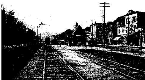
The old Ardsley railroad station.

Another way of reaching the same woods. . . will be to continue on the train until Ardsley Station is reached, crossing the stone bridge over the Nepperhan River, and turning down the Saw Mill River Road, where, just past the village a road goes over the hills from the left. This cuts through the heart of the woods, and is a quicker as well as easier way of reaching them. Nuts are so plentiful that it is advisable to take a laundry bag with one. This will not carry as much as an empty feed sack, but it is more calculated to suit the fastidious taste.